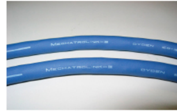
RS-MIII (20276) AWG22/4C