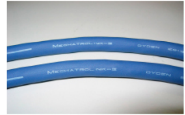
RS-MIII (20276) AWG22/4C